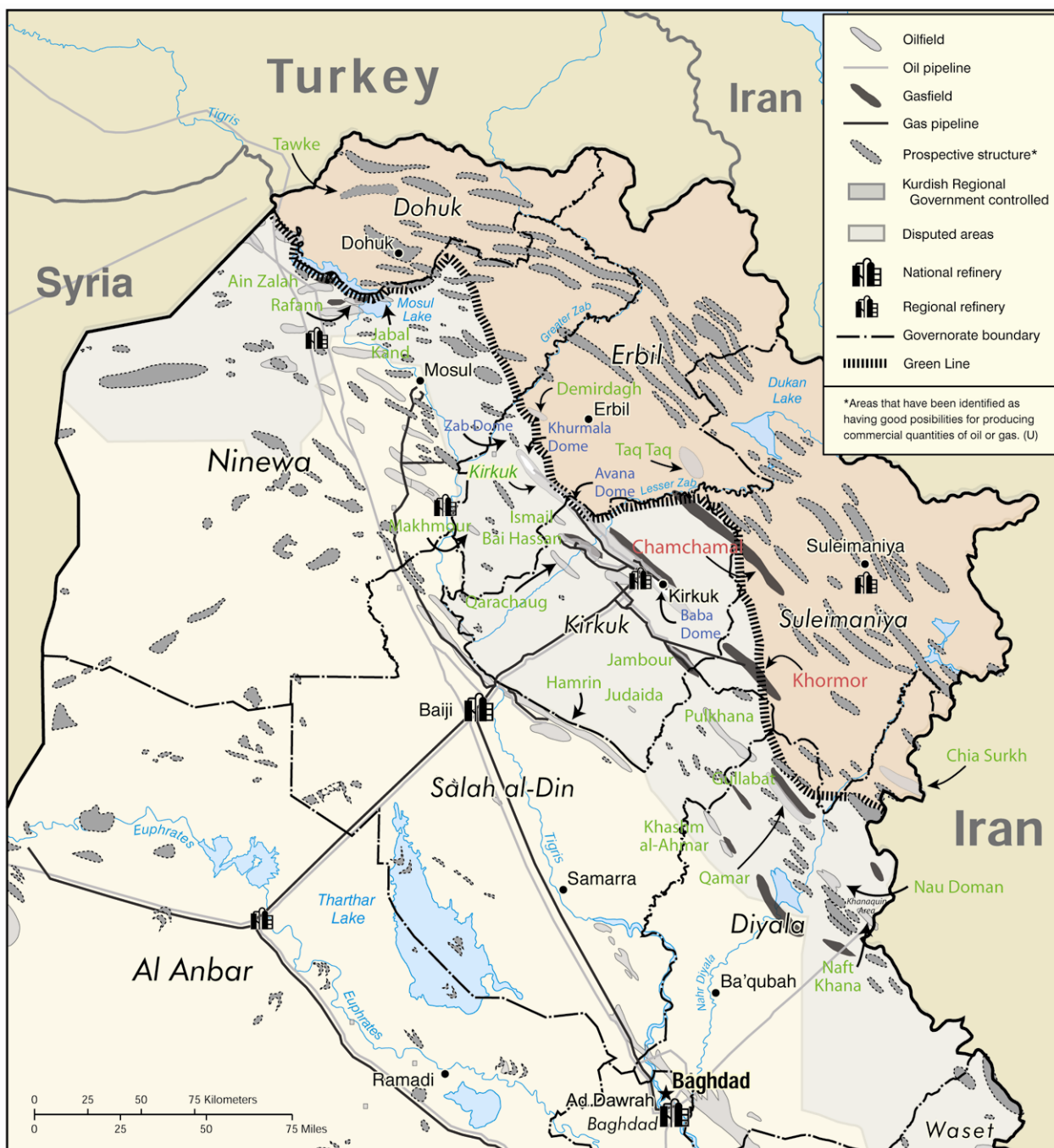
This map has been adapted by the International Crisis Group from a map made available by the U.S. Government. The Kurdish Green Line has been added, and the border of the "Disputed areas" adjusted to add more detail.