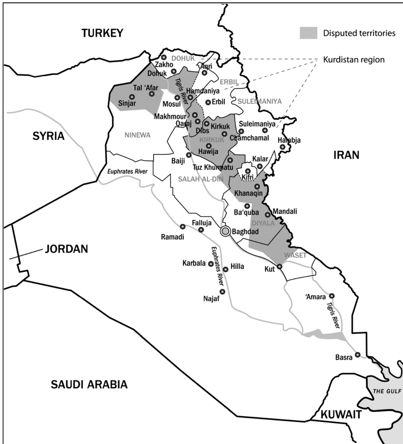
This map was produced by the International Crisis Group. The location of all features is approximate.