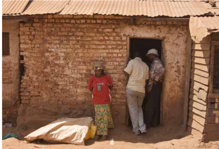
Mineral trading house in Bukavu, South Kivu.

Contrary to what some companies allege, we found that it is fairly straightforward to tell from where the minerals originate, as both dealers at the buying houses and government mining inspectors demonstrated to us. Each sack of minerals had different coloration and texture, depending on which mine it came from.