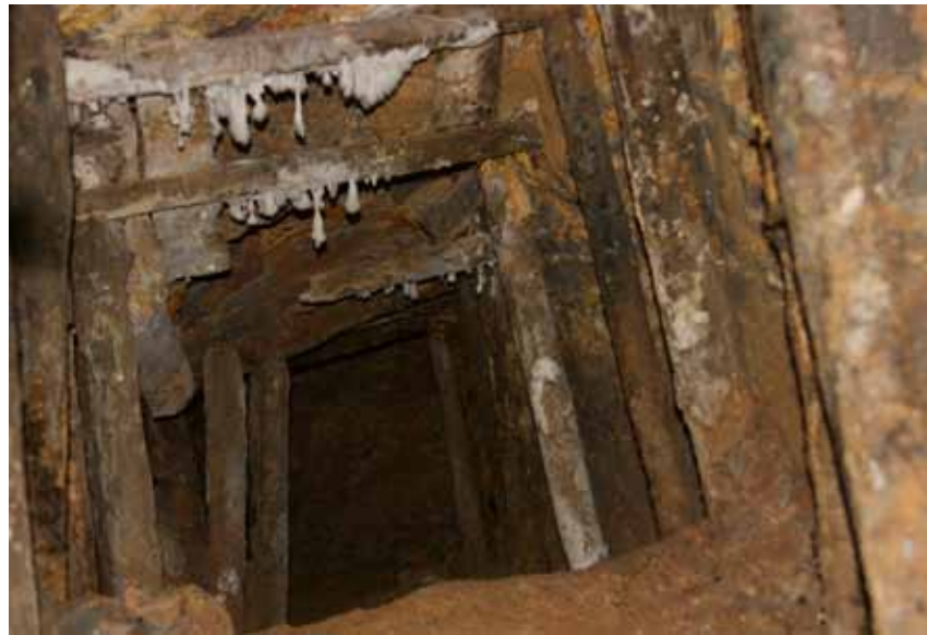
Kaniola gold mine, South Kivu.

Armed groups control the mines in different ways. For example, at some mines the FDLR forces people to work, while at others their relationship to the local population is more strictly commercial. 6 Working conditions at the mines are abysmal. As a leading minerals expert from the region described, “In the FDLR mines in Burinyi, the local population is there, but they are like slaves.” 7 There are no health and safety standards for miners in the area from which the 3Ts and gold originate. The average wage for a miner is between $1 and $5 a day, and as the World Bank has documented, the mines are also filled with child laborers between the ages of 10 and 16, now missing out on precious years of school. Ben, 15, told us that he had worked in a mine since he was 10 and narrowly avoided a mine shaft collapse last year, a common occurrence. The conditions are slightly better in some of the mines, but as Robert, a local youth leader and civil society activist told us, “Overall, mine workers get very little from mining; in the armed areas it is only worse.” Meanwhile, the armed groups rack up the profits at the mines, earning up to 90 percent of the profits in some areas. 8 [include photo of child laborer here] Every dollar captured by the armed groups is a dollar that does not go into improving Congolese lives through better schools, health care, or jobs.