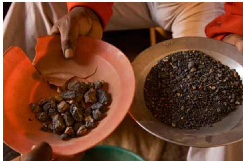
A minerals dealer compares tin ore from a rebel-held mine and a government-controlled mine.