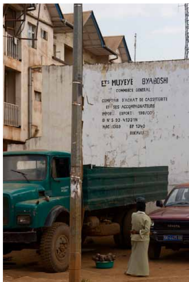
An exporter cited by UN experts as purchasing minerals from the FDLR.

There are also massive concerns with the gold trade. According to Congolese government sources, in 2008 Congo legally exported only 270 pounds of gold, compared with an estimated 11 thousand pounds of production. 9 This means that the lion’s share of the profits for the gold trade accrues to the armed groups, further fueling the cycle of violence in Congo.