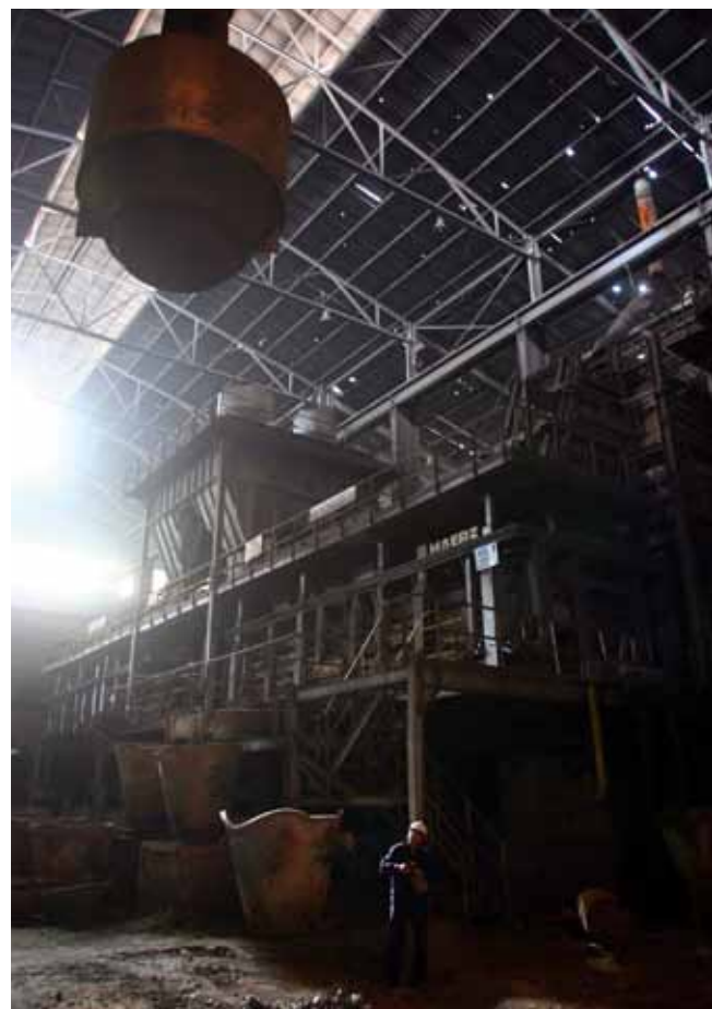
Inside a tin smelter.

The International Tin Research Institute, or ITRI, a membership association consisting of major tin smelters, has developed an initiative to improve due diligence for tin from eastern Congo. Together with certain metal traders and Congolese exporters, they have developed a three-step approach to developing a more traceable supply chain. So far, the measures taken remain insufficient, but with a more robust system of independent audits that would ensure that companies are not responsible for policing themselves, this initiative could positively impact the trade. 16