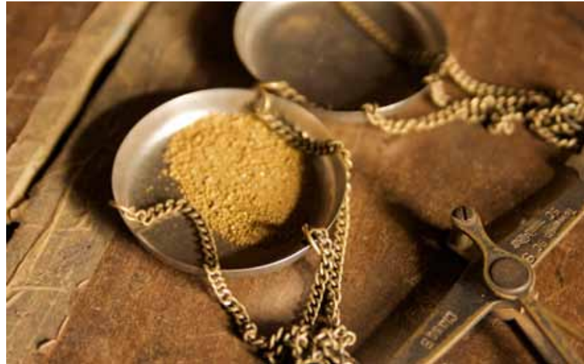
Gold powder is tested and weighed within dealerships.

In Uganda and Burundi, buying shops also work closely with officers in the security services—the army and police of the country—so that their investments are “protected.” Military officers receive cuts from this trade, and use their security connections to keep business flowing smoothly. This climate of repression and the real threat of violence is enough to dissuade most whistleblowers. Some of these traders have been put on United Nations sanctions lists for trading in conflict minerals, so they maintain underground profiles to avoid the spotlight and further sanctions.