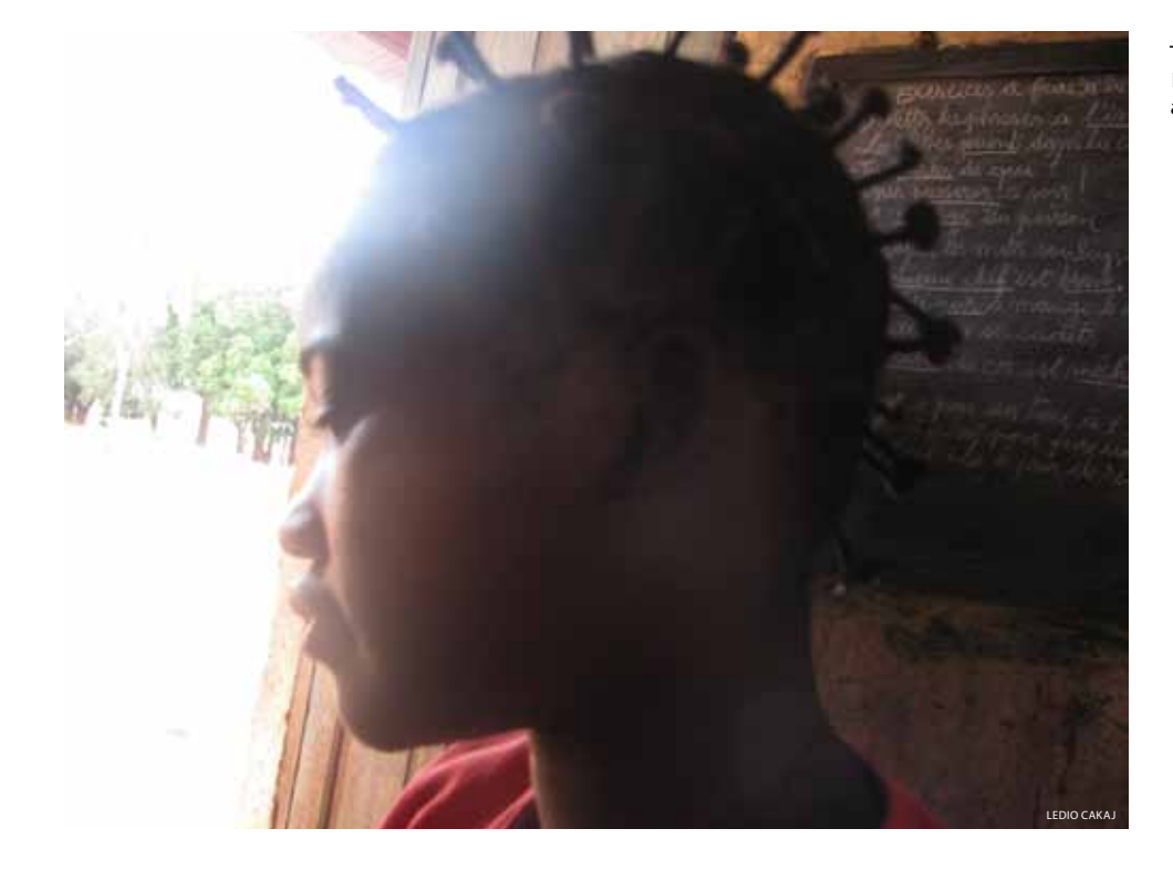
This girl was abducted by the LRA from Djemah in October 2009, but later escaped and returned home.

Kony's group moved north toward Djemah. Located on the southern tip of a huge forested area called the Zemongo Reserve, Djemah is split in two by Ouara River, the neighborhood of Fouka in the north, and the rest of Djemah in the south. One team from