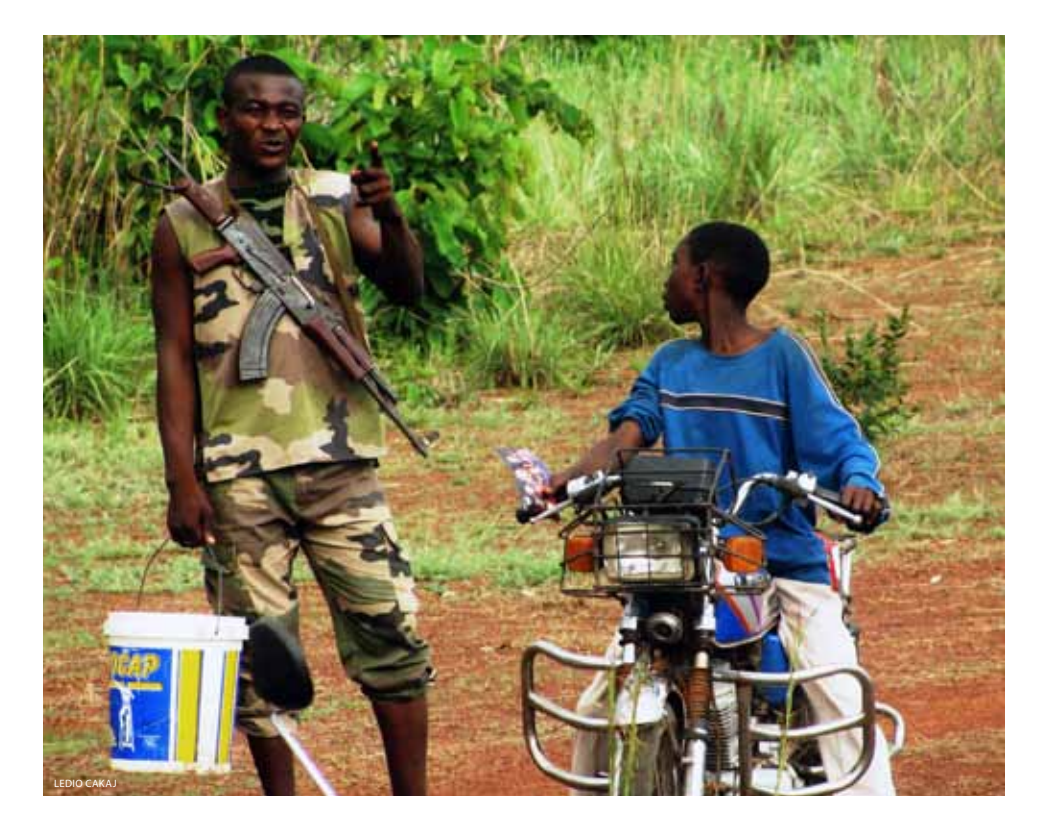
A CAR army soldier and a boy on a motorbike. The CAR armed forces are few in number in LRA-affected areas, and unable to protect civilians effectively.

The CAR armed forces are traditionally weak and often divided. The Forces of the Central African Republic, or FACA, numbers only around 5,000 personnel, although the number of soldiers on duty at any time is a fraction of that. These forces rarely stray from the capital, are paid infrequently, and have a miserable human rights record.